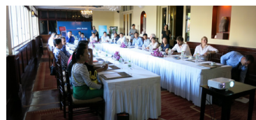
Workshop | Taxes & Contracts: the A-B-C's of Compliance

The workshop was followed by a networking event at Hard Rock Café. It was a pleasant occasion for Siem Reap's business community to mingle and get updates from the organising associations on the planned activities for the next months.